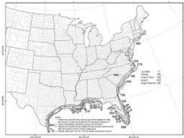
Figure 2: ICC 500-14 Figure 304.2(2) Shelter Design Winds for Hurricanes