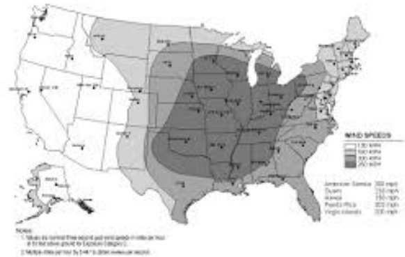
Figure 1: ICC 500-14 Figure 304.2(1) Shelter Design Wind Speeds for Tornadoes

After considering all of the possible load cases, the most critical part of the design